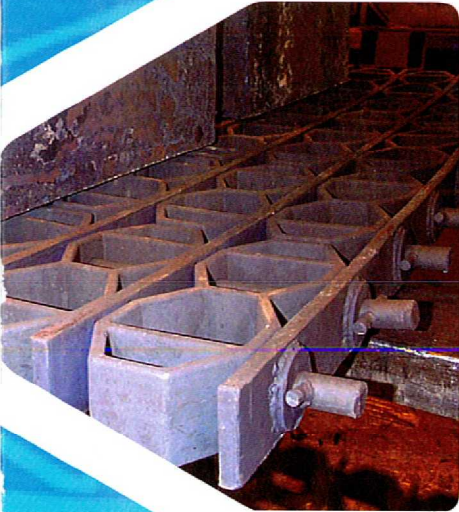
3000# forgings sitting on a POWER GRID™ ready for a heat treat and water quenching operation